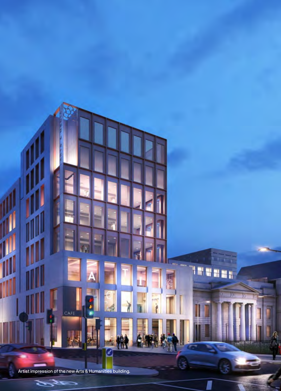
Artist impression of the new Arts & Humanities building.

Manchester School of Theatre is currently based at 70 Oxford Street: a historical building at the heart of Manchester's thriving Oxford Road corridor fitted with modern rehearsal, study and socialising spaces. Our facilities include: